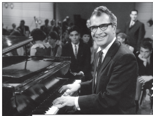
Dave Brubeck. Jazz at Oberlin.

If you held my feet to the fire and made me pick my all-time favorite jazz album, I guess I'd have to nominate Brubeck's Jazz at Oberlin , so that tells you that I am a fairly conservative fan. You might say: "Wait a minute, pal, that's not even Brubeck's best album—what about Time Out , which contains "Blue Rondo A La Turk" and "Take Five," the best selling single in jazz history? And it has Joe Morello on the drums, which took the quartet to a new level?" I'd reply that you are right; that was a great album, but Oberlin has five tunes recorded with the immediacy and excitement of a live audience.