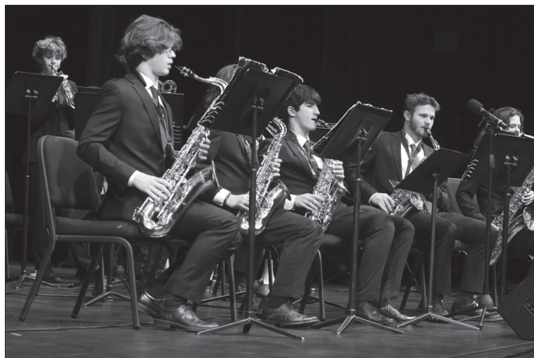
M-A HS jazz ensemble sax section