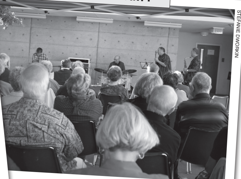
A lovely day for good music.