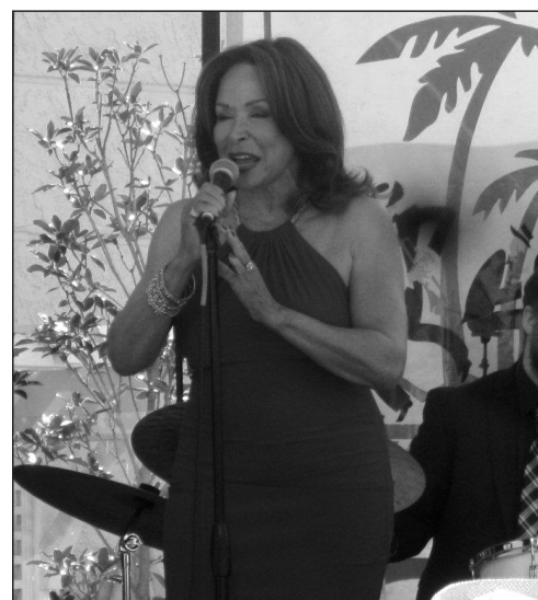
Vocalist Freda Payne

In an answer to "where is jazz headed?" Houston Person responded, "Jazz is here! It is not going anywhere and we as musicians have to relate to our audience, whether it's blues, dance music, or jazz. That is our responsibility."