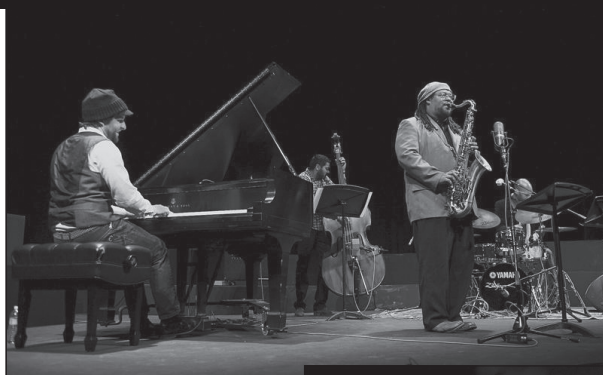
Eigsti Concert