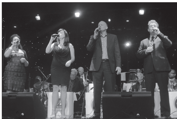
The New York Voices