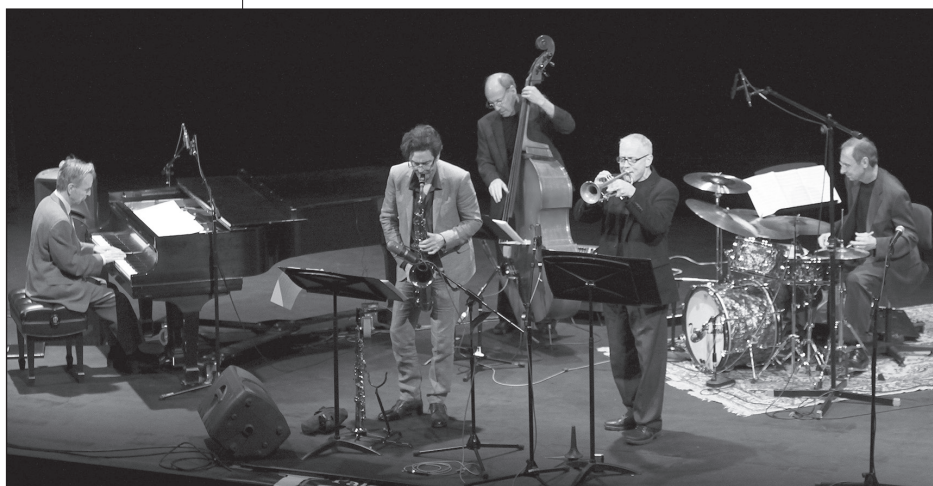
The Joe LaBarbera Quintet in concert December 14th.