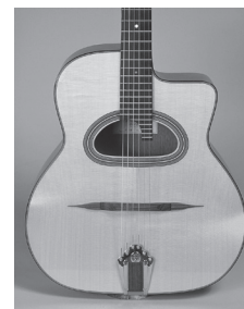
Grande Bouche guitar

Grande Bouche "Large mouth" in French. The original Selmer jazz guitar designed by Maccaferri, with a Large, D-shaped sound hole. This design is still preferred by rhythm players in jazz manouche ensembles.